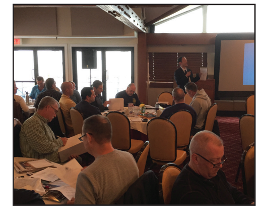
continued on back

If you become disabled due to any covered respiratory illness, covered cancer, or PTSD, before the 25th anniversary of your retirement, you are entitled to reclassification of your pension under the WTC Presumptive Law. In order to be reclassified, you must file an